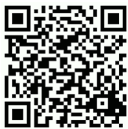
B360 3D demo